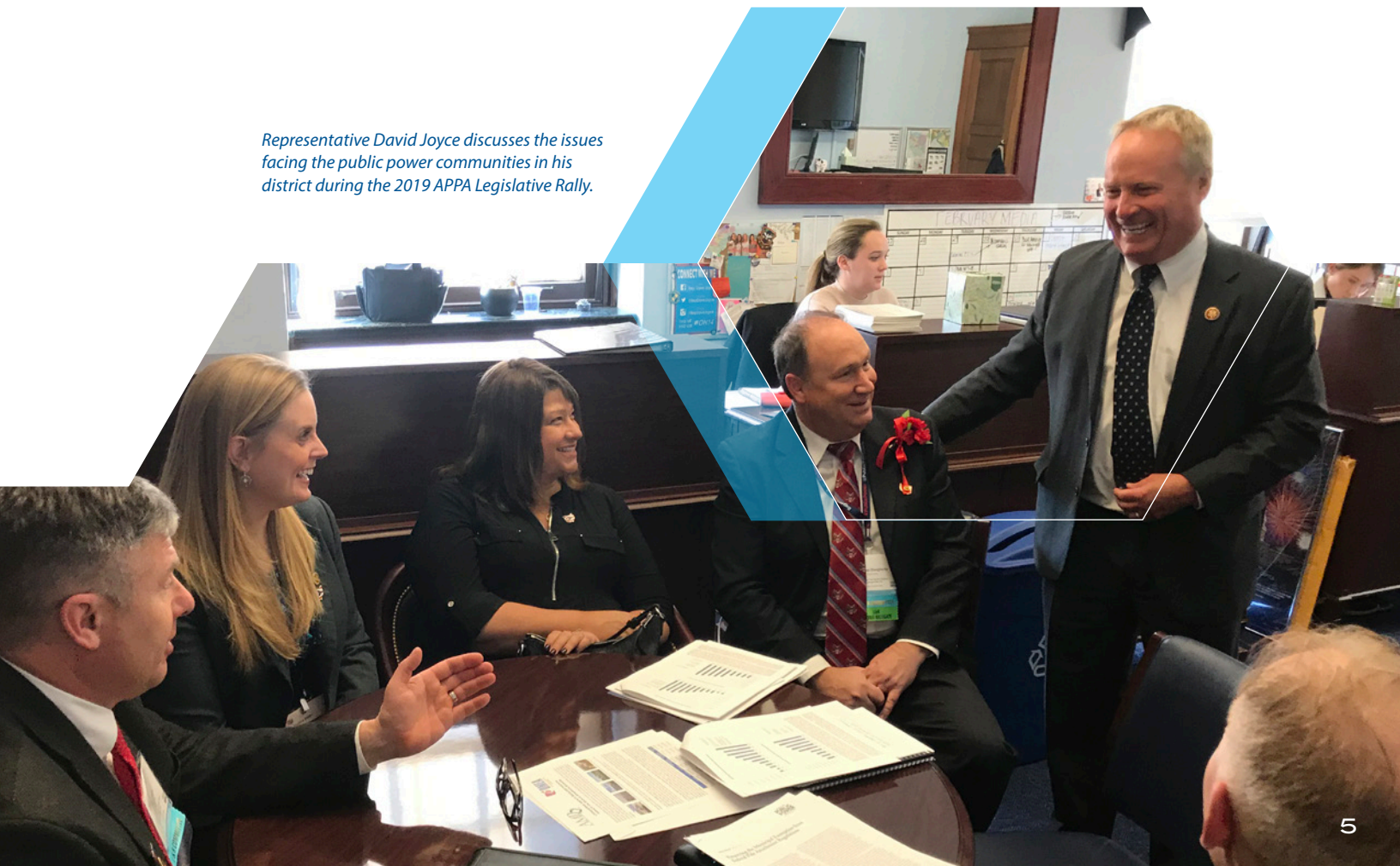
Representative David Joyce discusses the issues facing the public power communities in his district during the 2019 APPA Legislative Rally.

Our position papers covering the sequestration of Build America Bonds, supplemental transmission costs and FCC regulation of pole attachments are available for review on the AMP Member Extranet.